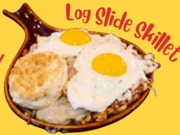
Log Slide Skillet