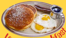
Legendary Breakfast #2